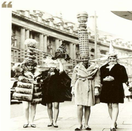
My goal is to do something outrageous every day. Maggie Kuhn (1905-1995)

I hope you like the photo. It sums up my philosophy of faith. The caption reads, "My goal is to do something outrageous every day." I received this photo from my aunt right before I left to go to Uganda on a mission trip. This was a big step of faith for me but God equips those he chooses, right? Anyway, I signed up and then immediately began to have anxiety attacks about being on a plane for so many hours. I would just rather be strapped to the wing, if I had a choice; I'm claustrophobic. For weeks this went on and finally, God was faithful and gave me Matthew 8:26 where Jesus tells his disciples "You of little faith, why are you so afraid." Well, it was a moment for me, kind of a "duh" moment, if you really want to know. God telling me just like the twelve, "how much more do you need to see to believe?" As the days grew closer to our departure, I prayed harder and God continued to reveal his grace to me. Do you know that there are 366 scriptures on fear! One for every day of the year plus one for leap year! I got His message from Scripture, from my own prayer time, from others praying for me, from the book