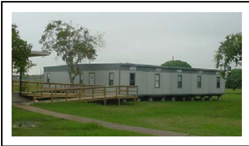
New Building Exterior

It is hard to believe it has already been six months since I came aboard as the Emmaus Community Lay Director. We have had some wonderful things happening in His glory. In June, we were met with the dilemma of certain "unknowns" regarding the continued use of Bishop Gracida as our retreat center for the Walks. But God provided us with a fabulous building, the use of which has facilitated "the best Walks ever!" As I have conveyed to you previously, we are still in need of funds to finance this acquisition. As can be seen from the photos, your money will be well spent. Please take the time to make the donation that has affected and will affect so many Pilgrims on their respective Walks, Journeys and Flights.