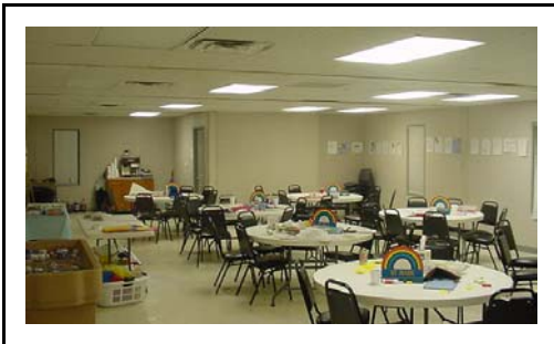
Project Room Interior

It is hard to believe it has already been six months since I came aboard as the Emmaus Community Lay Director. We have had some wonderful things happening in His glory. In June, we were met with the dilemma of certain "unknowns" regarding the continued use of Bishop Gracida as our retreat center for the Walks. But God provided us with a fabulous building, the use of which has facilitated "the best Walks ever!" As I have conveyed to you previously, we are still in need of funds to finance this acquisition. As can be seen from the photos, your money will be well spent. Please take the time to make the donation that has affected and will affect so many Pilgrims on their respective Walks, Journeys and Flights.